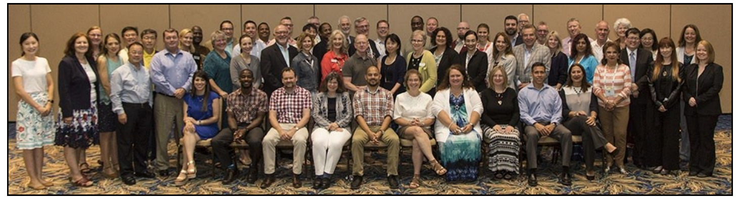
IAFP Affiliate Council Meeting, July 9, 2017.

9. Representatives from Oklahoma, Arkansas, etc.: Facilitate interaction between "Food Innovation Center/Incubator" (at state level) and small manufacturers by a) encouraging small manufacturers to join Affiliate Annual Meeting/ Conference with free registration and exhibition booth to be provided to manufacturers and b) soliciting funds (by Affiliate) from local government to help small manufacturers to build up website; involve graduate students in FSMA training by designing "case study" course using selected small manufacturers (including site