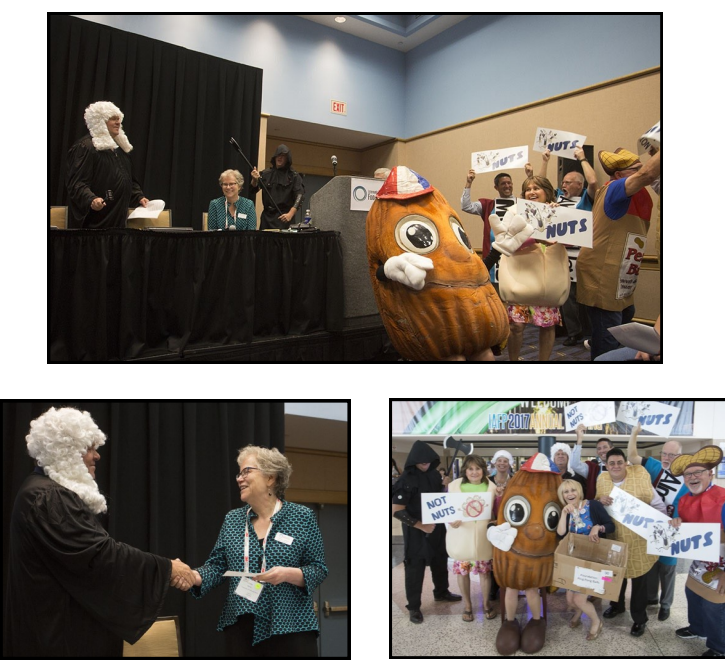
The Florida Association for Food Protection once again provided entertainment this year with their courtroom antics at the IAFP Business Meeting during IAFP 2017.