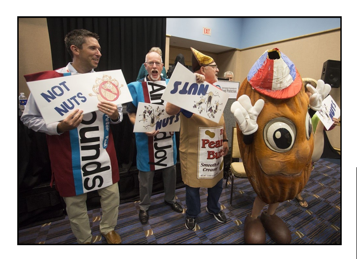
You'll find dozens of photos from IAFP 2017 at: https://www.flickr.com/photos/iafp/albums

Thanks once again, FAFP, for your generous contributions and for the entertaining antics that always amuse audience members.