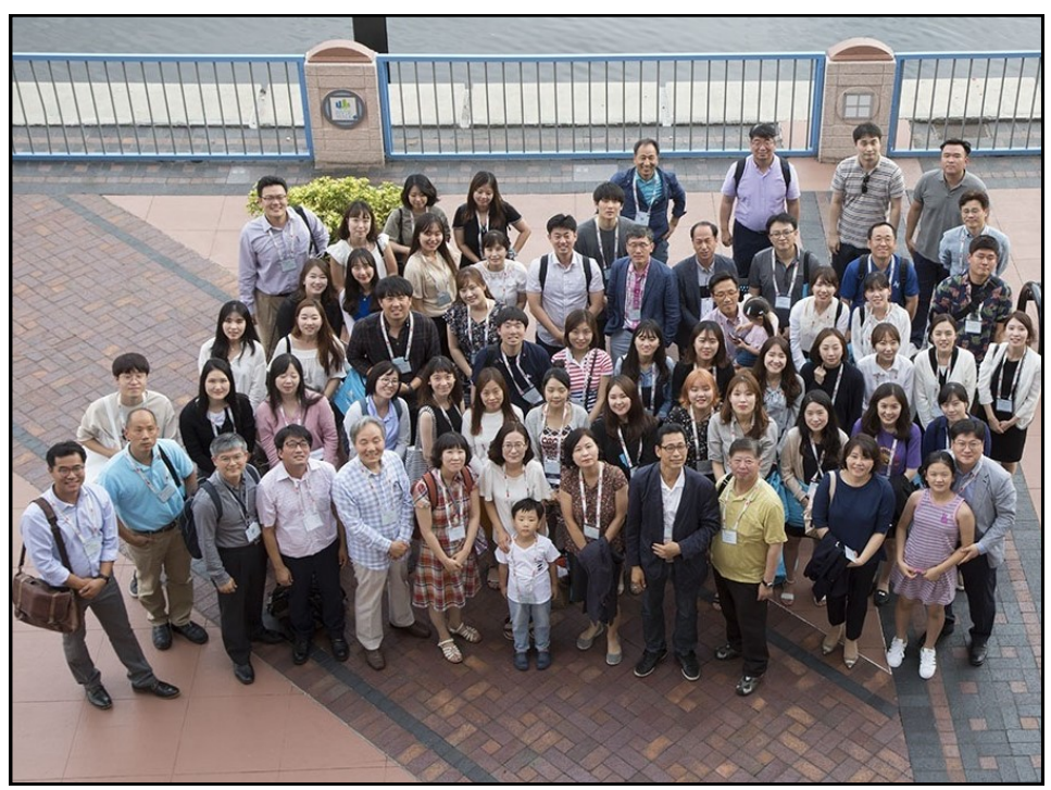
Members of the Korea Association of Food Protection (KAFP) Affiliate met during IAFP 2017 in Tampa, Florida.